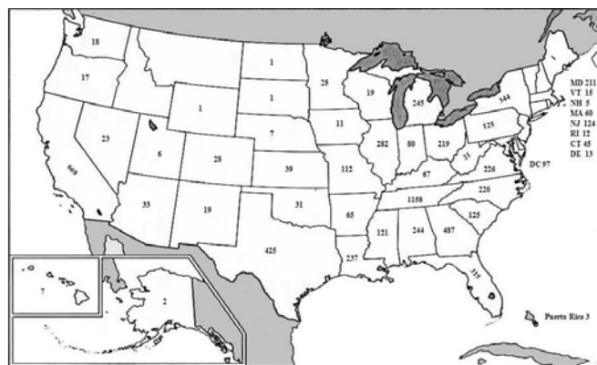
Fig. 1 Distribution of Medical and Dental Graduates in 1950-2013

Secondary data were extracted from Meharry Medical College's alumni tracking system which contained practicing specialties and locations from 1950 to 2013. All datasets were de-identified before being obtained for the study to protect the privacy of the graduates. A sample of 3,864 college graduates (2,464 medical and 1,400 dental) in years 1975 – 2013 was selected from a total of 6,896 college graduates (4,682 medical and 2,214 dental) in years 1950 – 2013 (See Fig. 1).