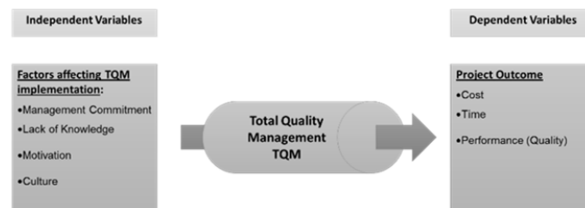
Fig. 1 Research Model

The following model which is presented in Fig. 1 will be used in the study.