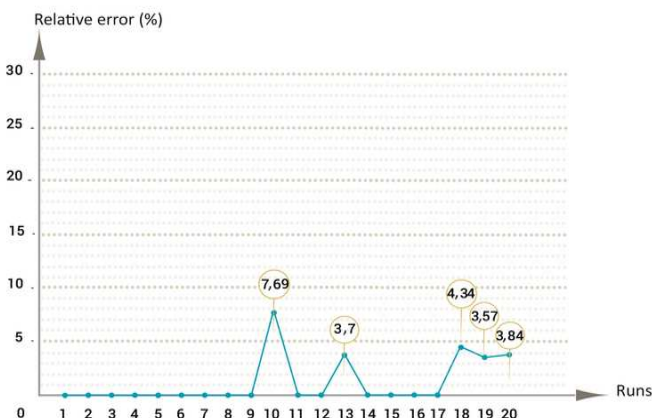
Fig. 3. Relative error of the two-phase algorithm for a network topology with 10 nodes, 26 fiber links and 40 wavelengths per fiber link.

the minimum number of used wavelengths by solving problem (EQ-RWA) with the GUROBI solver. Fig. 3 shows the relative error of our two-phase method for each of the twenty instances. In each instance, all lightpath requests are routed. As can be seen, our method does not obtain an optimal solution for only 5 of the 20 instances. The average relative error is about 1, 15%.