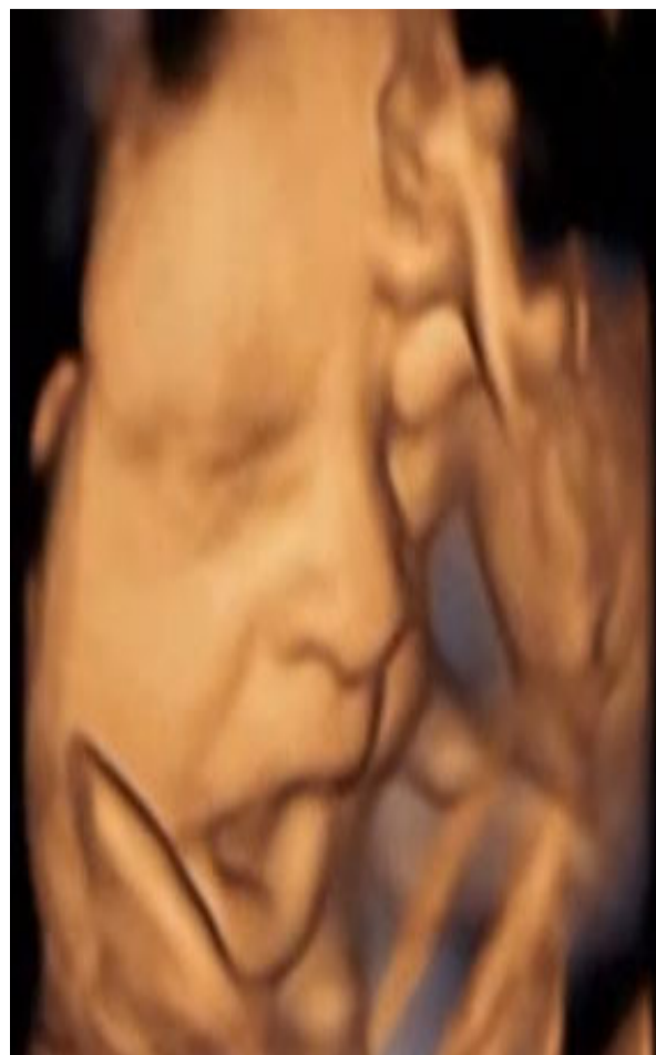
Fig. 4 Yawning in the foetus [18]

Yawning has been observed in the foetus (Fig. 4), and has been depicted for centuries in Japanese sculpture (Fig. 5); and even the famous Chiricahua Apache Chief of South East Arizona, United States, and Medical Man, Geronimo (1829 – 1909), was named “One Who Yawns” (Fig. 6).