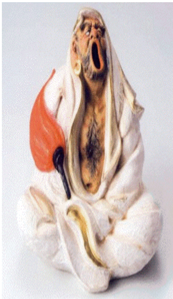
Fig. 5 Japanese sculpture depicting yawning