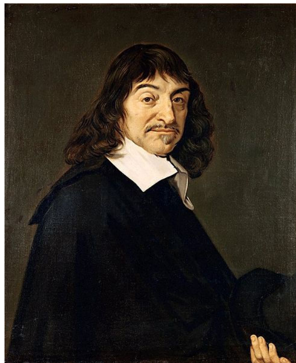
Fig. 1 René Descartes (1596– 1650)