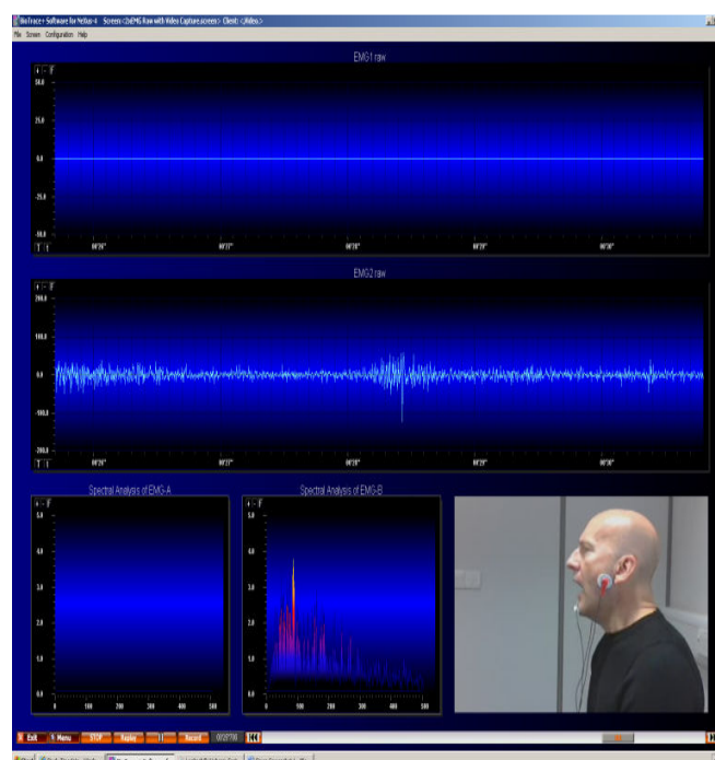
Fig. 3 EMG recording of the yawn reflex

Saliva samples were collected at the start and again after the yawning response, together with electromyography (EMG) data of the jaw muscles (using non-invasive surface-placed electrodes) to determine rest and yawning phases of neural activity (Fig. 3).