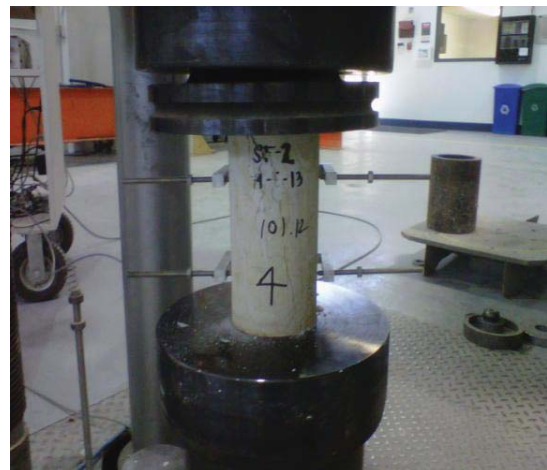
Fig. 5 Compressive Testing of the Overlay Material

In order to measure the compressive strength of the overlay material, standard 100mmX200mm cylindrical specimens were poured and tested after 28 days (Fig. 5).