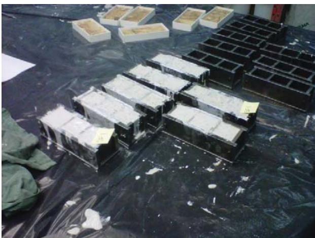
Fig. 3 Standard Cube and Shear Bond Specimen Molds