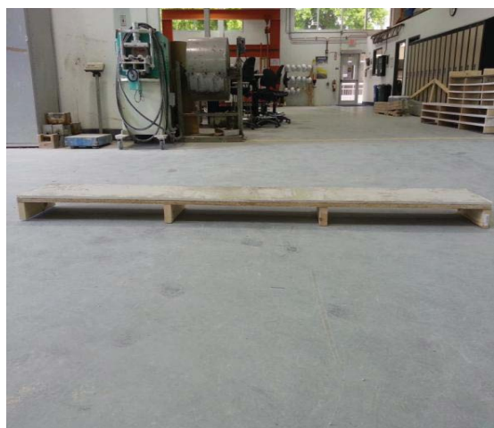
Fig. 6 The Structural Test Specimen