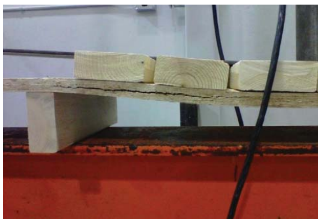
Fig. 12 Delamination within the OSB due to excessive shear stress