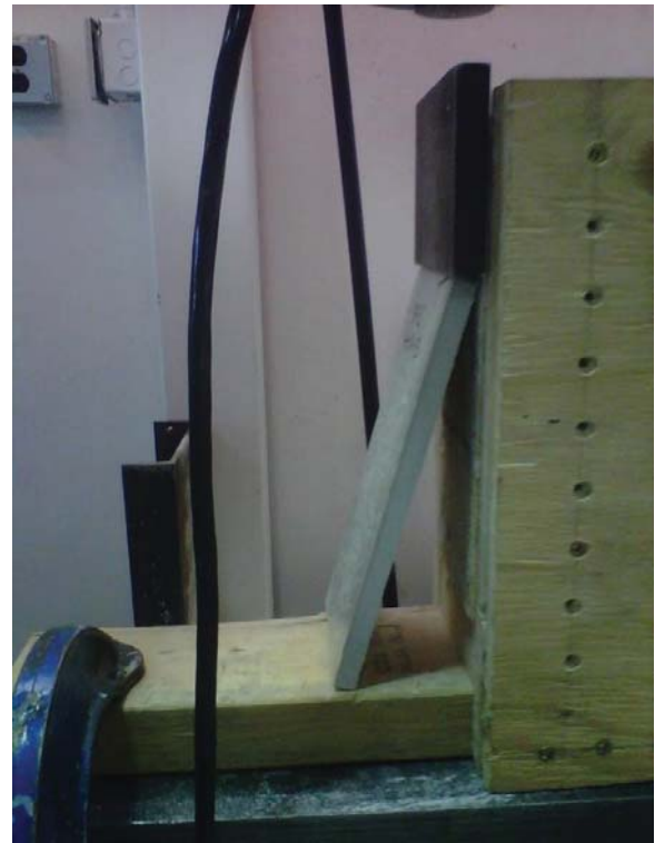
Fig. 4 The overly separated from OSB due to slip failure