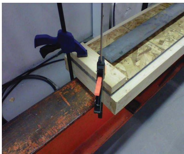
Fig. 10 C clamps were put in place to hold the end supports from lifting