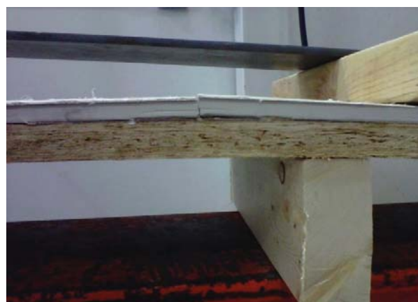
Fig. 11 Tensile crack in the overlay on top of the intermediate supports (negative bending moment)

Another mode of failure was the delamination at the bond surface between the overlay and the OSB (Fig. 13).