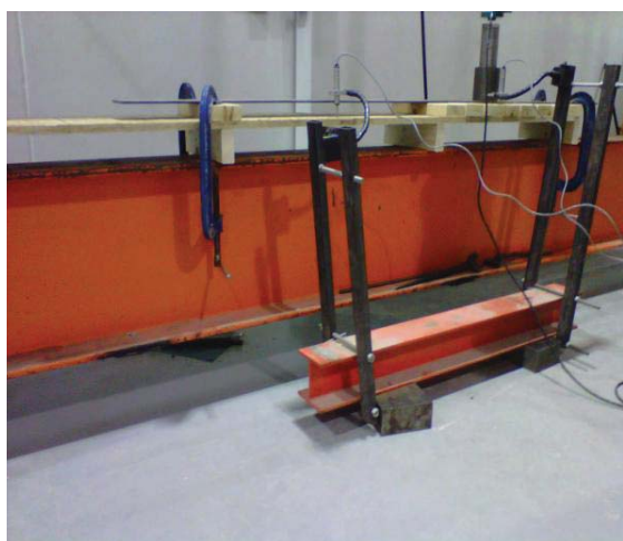
Fig. 7 The Side Span Loaded by the Distributed Load System