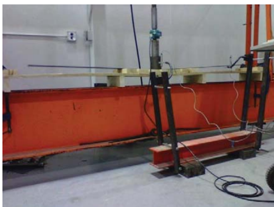
Fig. 8 Center Span Loaded by the Distributed Load