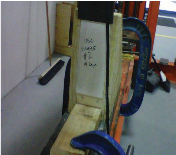
Fig. 2 The overlay layer was pushed down in order to measure the shear bond strength between OSB and the overlay