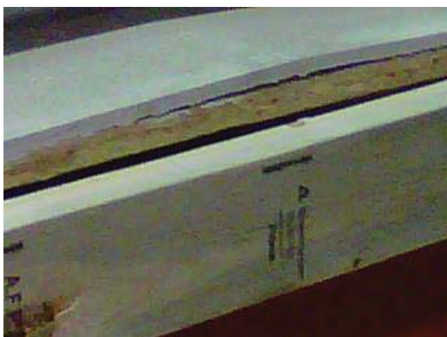
Fig. 13 Delamination between the overlay and the OSB