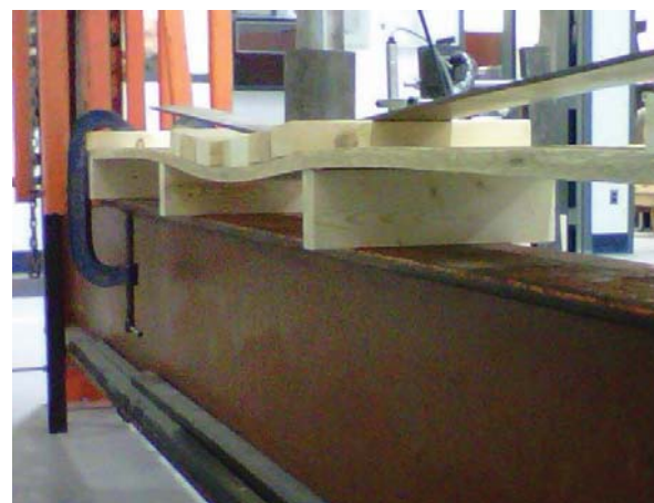
Fig. 9 The uniformly distributed load is mimicked by a series of wood blocks under the steel bar

A 6mm thick steel bar was used to distribute the point load from the loading ram to a series of closely spaced 38mmX89mm pieces of SPF lumber that in turn transferred the load to the surface of the test specimens to mimic an approximation of a uniformly distribute load (Fig. 9).