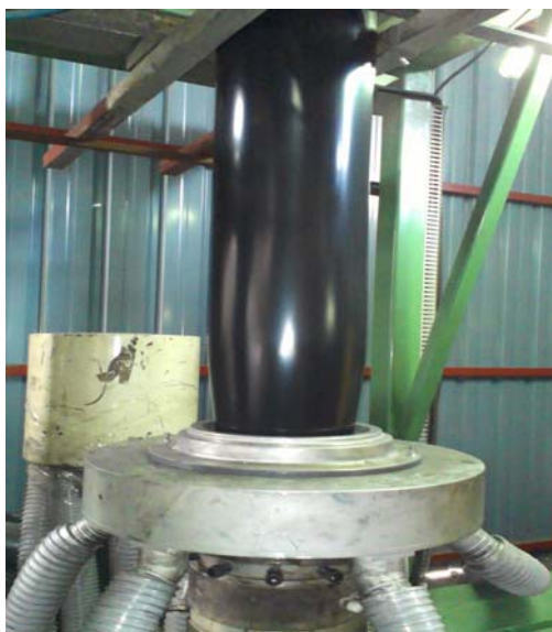
Fig. 2 Polybag being blown out from blowing machine die.

As in agriculture, almost all of the used polymeric materials are discarded and often left unattended into soil or being disposed in the landfill. This is due to the high cost of removal and less potential of recycle due to the high percentage of foreign contamination. Thus, the interest of developing degradable polymer is becoming more important and crucial as to counter measure the problem of pollution and soil sterility caused by the polymer wastes. Photodegradable polyethylene has been developed and the processing parameters have been studied in order to produce the desired product for application in the agriculture, product packaging or even medicinal.