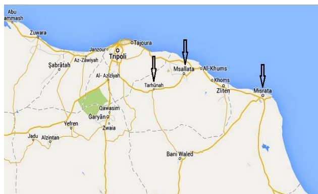
Fig. 1 The location of municipal wastewater treatment plants

Reagents used in this study were of the highest available quality i.e. analytical grade. All solutions and dilutions were prepared in bidistilled water.