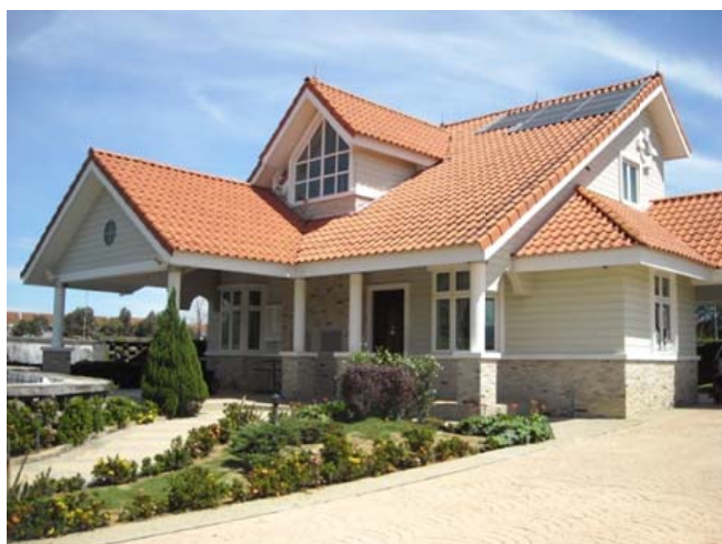
Fig. 3 Smart and Cool Home

the foundation, external water tank, driveway and fence absorb heat from other parts of the house and occupants and dissipate it quickly. In order to complement the construction system, night ventilation was also practiced at this house. No a/c was installed at the house. The interior of the Semenyih house has been recorded to be at least 7°C lower than outside temperatures [23] which needed only the ceiling fans to increase air speed within the house to achieve thermal comfort.