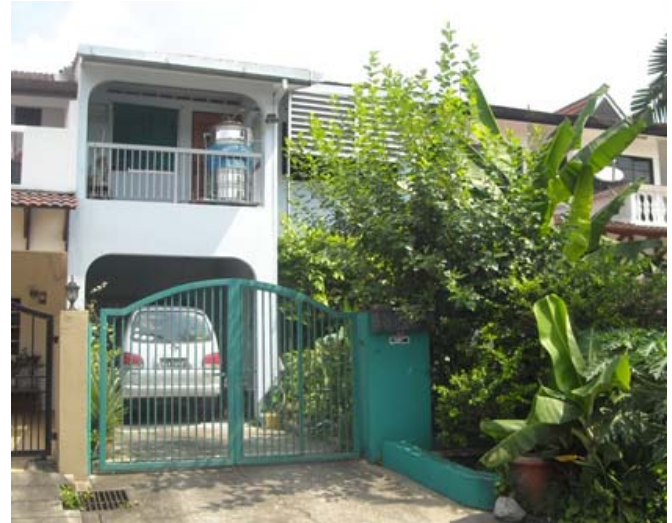
Fig. 2 CETDEM's DCEE House

CETDEM is the acronym for Centre of Environment, Technology and Development, Malaysia. It has been actively involved in research and education to improve the quality of the environment [17]. In doing so, they have modified the late 1970's home of its founder in bustling SS2 urban centre in Petaling Jaya into a demonstration house for public awareness. This was achieved with funds from the Danish International Development Assistance (DANIDA). Construction work took 60 days to complete at a cost of MYR 100,000 [18]. The renovation involved retrofitting the existing roof with reflective aluminum foil to reflect heat from the sun and 'Rockwool' insulation. New counter-battens were laid beneath the reused clay tiles to allow hot air trapped underneath to move freely out of the roof. New aluminum louvers are also fitted to shield all windows from morning and afternoon sun.