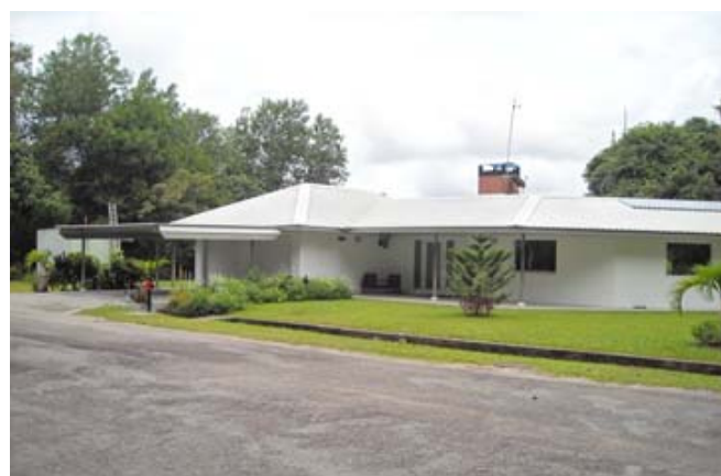
Fig. 4 CoolTek House

The house was planned properly with only small walls and windows facing East and West (morning and afternoon sun) and larger fenestrations were orientated to the North and South to receive diffused daylight. The East and West walls were also shaded away from the sun by vegetation. All fenestrations were set deep into the external walls and were sheltered by deep overhangs that stretched around the house. The foundation of the Melaka house was a conventional concrete trench to carry the load bearing walls which effectively reduced the amount of concrete and steel reinforcements needed to build the house. The load bearing walls were made of 250mm thick AAC blocks and painted white to mitigate heat and sound transmissions while the windows were all double glazed with a low emissivity coating to stop heat radiating through [30], [31].