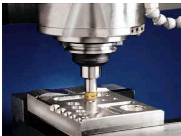
Fig. 1 End Milling Operation on D2 steel

systematic approach that can help to set-up milling operations in comparatively lesser time and also achieve the desired surface roughness quality. Due to high tolerances and good surface finish values that milling can deal, it is ideal for adding precision features to a part whose basic shape has already been formed [4].