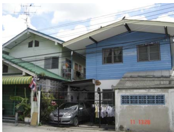
Fig. 2 Wood and mortar house (with fence)