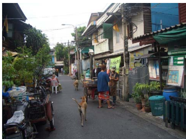
Fig. 5 Road in Community temple Ranokhang 72