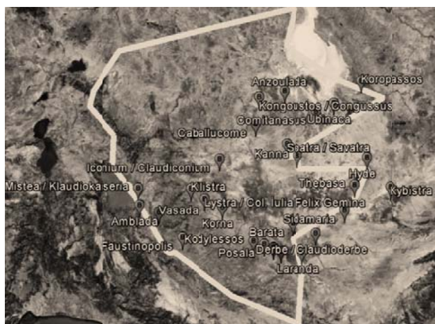
Fig. 4 Classical Period Settlement Region in Lykaonia

Vasada (Ousada): It is on the antique road 65 km southwest of Bostandere - Konya. In Ptolemaios, it is referred as Hellenistic City. It sent representatives to 451, Chalcedon consul [26]. There are ruins of a theatre with the capacity of 1000 audiences [3] (Fig. 4).