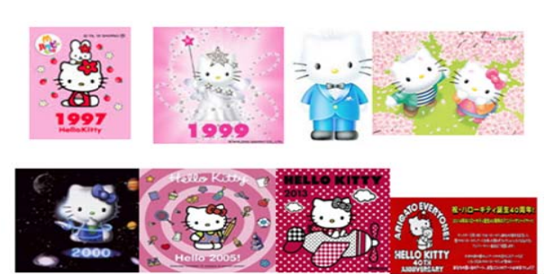
Fig. 3 Kitty's Change from 1997 to 2014

Currently, the 50,000 Kitty's products outnumber Disney's products on the market, and are sold in 60 countries. Sanrio depends on 80 percent of its profits on Kitty's production in-house. In 2012, Sanrio sells Kitty's license to 3,000 stores in the US Walmart [4]. Moreover, they enthusiastically work for license business in the European market, and now they are serious about going into the Chinese market to establish Asian companies. These products include not only daily use products such as food, clothes, cosmetics, furniture, but also stock certificate and financial products such as gold coins, and transportation vehicles such as taxies, buses, and train. In Japan, Kitty's labels can be found in food, cosmetics, furniture, buses, cars, PCs, jewelry, stationary items, just to name a few. You can say we are saturated with Kitty's products nationwide.