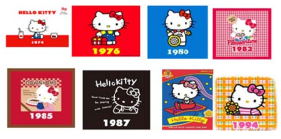
Fig. 2 Kitty's Change from 1974 to 1994