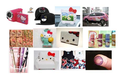
Fig. 4 Kitty's Products (Right Bottom: a Contact Lense with Six Kittys)

Hello Kitty Cristal Dog House costs $31,660 which was decorated with gorgeous crystals, with Kitty's face designed on the bottom surface. The Hello Kitty Handbag costing $100,000 is decorated with Swarovski crystals. The most expensive Kitty is of Platinum metal made to commemorate the 35th anniversary of Kitty created by Austria's Glass manufacturer, Swarovski at the sum of $152,585 [5].