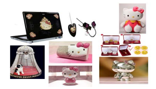
Fig. 5 Expensive Kitty

If you live in Japan, you can easily collect Kitty's goods just as you frequent a McDonald, or Kentucky Fried Chicken fast food restaurant, you can find Kitty's items such as dolls, stickers, plates, lunch boxes in collaboration with other companies. Kitty's shows and movies have produced and shown. Kitty also remade the world great fairy tales such as Thumbelina, Cinderella, White Snow, Hansel and Gretel, and etc. In addition, board and card games and Nintendo DS electronic games featuring the Kitty character were also created.