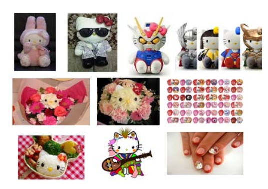
Fig. 7 Variation of Kitty