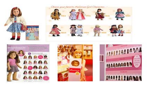
Fig. 6 American Girl

In the below, Kitty and American Girl are compared to see commonality and differences.