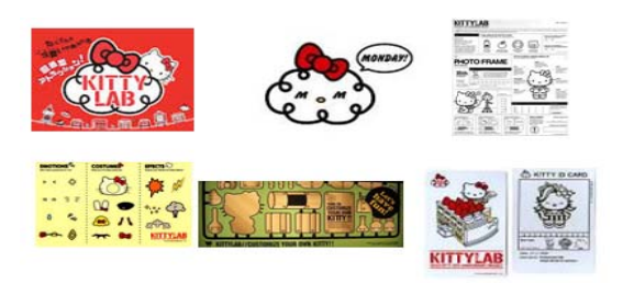
Fig. 9 KITTY LAB

It is unique that consumers can choose and change product's facial expression with their own choice because usually because of trademarks, character's shapesor faces are restricted as we can see Snoopy by Charles Schultz. Kitty's choice of its face gives consumers flexibility and enjoyment to create their own Kitty. In this way, we can interpret consumers realize their own autonomy by selection of products, which can lead their representation of identity.