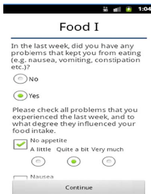
Fig. 2 The MONTE mHealth application

There were several security measures implemented to ensure safe access, data storage and data transport. First, the application is not widely available for download, but instead is uploaded by a clinician to the patient's smartphone if he or she chooses to participate in the program. Upon this time, the patient is also registered on the MONTE server with a username and password, which are by the client together for server-side verification. Second, upon first use of the application, the user needs to register a pin code that serves as an identity verification method in the application itself; whenever the application is accessed after being paused or returns from sleeping mode, the patient needs to enter a 4-digit pin code in order to continue with the surveys. Finally, to ensure safe communication with the server, all data are stored and communicated using an AES-256 encryption.