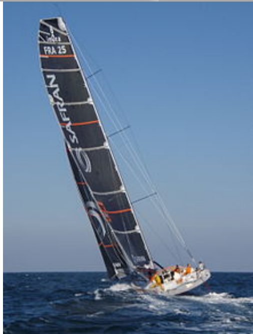
Fig. 1 Sailing Yacht