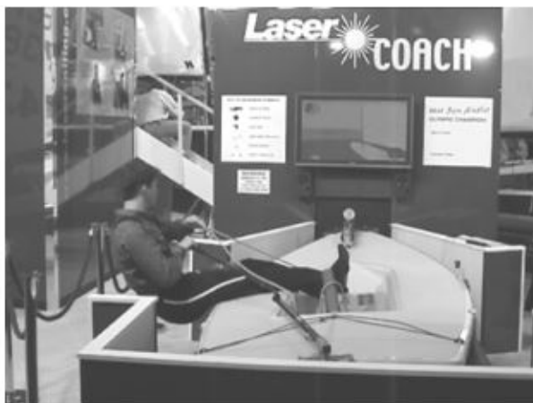
Fig. 7 Laser Coach’s Yacht Simulator

The user receives feedback from the visual representation of where the dinghy is relative to the wind and course, as well as feedback from the simulator in the form of rudder forces, mainsheet tension, heel moment and angle. It is then up to the user to balance these forces and moments.