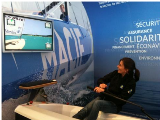
Fig. 2 VS-C1's Yacht Simulator