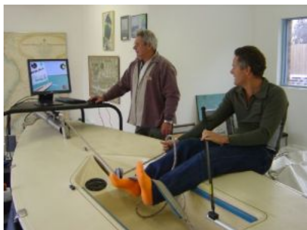
Fig. 11 Victoria's Yacht Simulator

Yachting Victoria's strategic objective for coaching is to increase the success of competitive sailors by ensuring the availability of coaching services for sailors wanting to improve their performance, skills and results by the, Development and support of qualified coaches, Development and support of coaching programs at clubs and recognized classes, Support coaching programs for those top competitive sailors with potential to make the Australian Sailing Team and Australian Sailing Development Squad, Provide well understood and excellent pathways for skills development for competitive sailors and coaches.