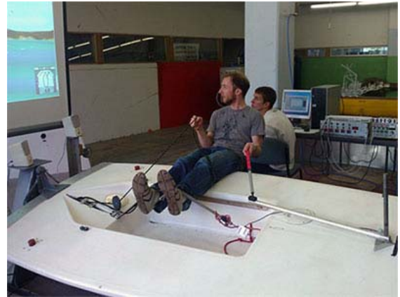
Fig. 3 Australia's Yacht Simulator