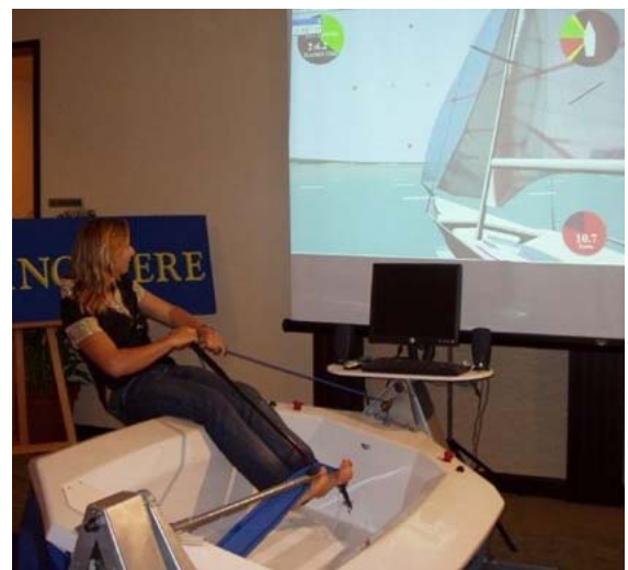
Fig. 4 Vsail's Yacht Simulator