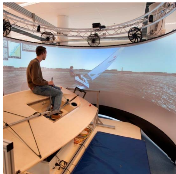
Fig. 9 InnoSportLab’s Yacht Simulator

InnoSportLab's virtual reality software tracks a vast range of physical responses to such things as rudder pressure, trimming actions and sheet tensions. Performance data can be read in real time. The simulator also stores complete race records that can be re-run later. The sail simulator is a product of Stentec Software BV and Delft University of Technology. The center runs several other hi-tech research projects in service of Dutch