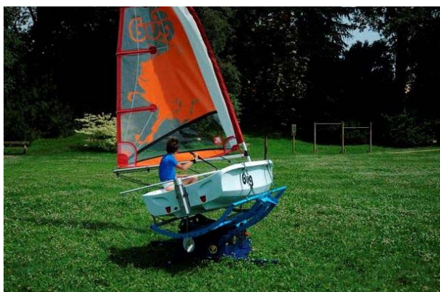
Fig. 6 Sailing Maker’s Yacht Simulator

The stable, solid, safe cradle ensures great adaptability for housing all classic sailboats: Optimist, Laser, RS, Equipe etc. Easily and quickly assembled without the need for special tools and entirely realised in painted steel to prevent corrosion from water and humidity over time. Four castor wheels make SAILING MAKER particularly safe and easy to manoeuvre, even with a full load. An industrial, low absorption fan positioned in front of the cradle modulates the right amount of air to create the best conditions for practising manoeuvres before attempting to do so on the water. Fig. 6 shows sailing maker’s yacht simulator [8].