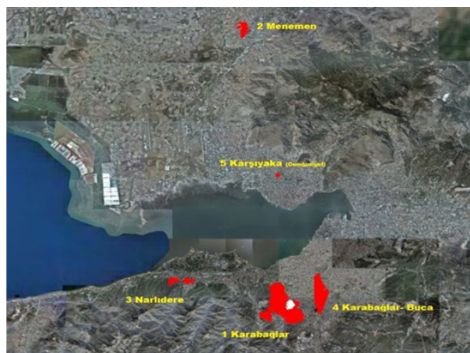
Fig. 2 At-risk areas determined by the İzmir Directorate of Infrastructure and Urban Transformation [11]

Also, through recently arrangements, the central government has become as efficient as local governments. In addition to the existing authorization of the Mass Housing Administration, the Ministry of Environment and Urban Planning is also authorized and in charge at various stages, from the approval of plans to their implementation. Based on statements made, it has been acknowledged that İzmir is among the pilot cities where urban transformation implementations will be initiated by the central government. The establishment of Directorates of Infrastructure and Urban Transformation in the Bursa, İstanbul, and İzmir provinces as field services of the Ministry of Environment and Urban Planning affiliated directly with the center has been resolved upon based on the Cabinet Decree dated August 13, 2012, which was proclaimed in the official gazette and took effect in September.