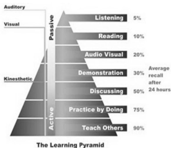
Fig. 2 Learning activities supporting learning retention

Its usefulness enables the learning retention to reach 90%. However, the Cone of Experience by Dale refers to learners while Fig. 2 [25] refers to effect of teaching methods to learning. This figure clarifies that the upper four approaches are deductive while the lower three are inductive. Reference [27] claimed that the retention differences between the deductive and the inductive instruction can be considered from learners' reflection and prudent cognitive process. So, Fig. 2 clearly shows that Discussion, Practice by Doing and Teaching Others help the learning retention rate soar to 50%, 70% and 90%, respectively