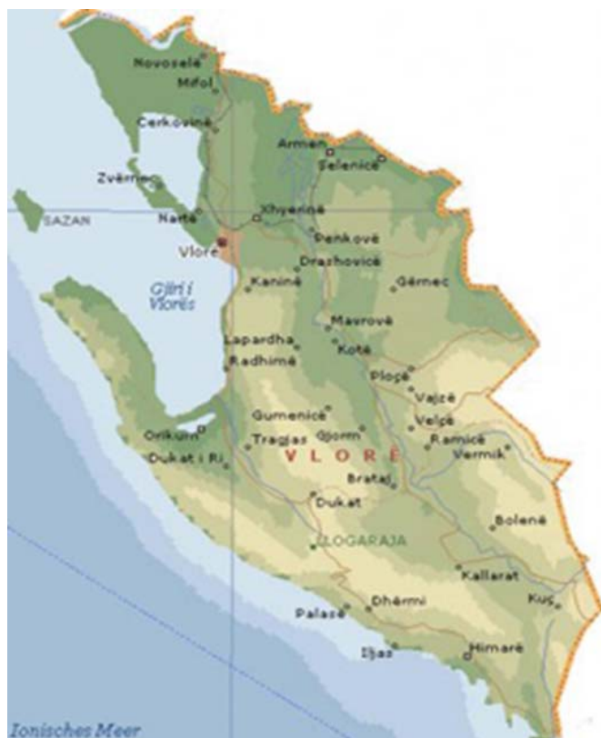
Fig. 1 Study area (Vlorë Bay map)

sides of the inlet. The bathymetry of the gulf, which reaches its maximum depth (50 m) in the central zone, shows it to be, on average, 20 m.