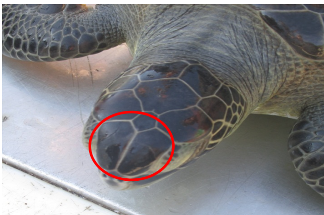
Fig. 4 Head of an individual of Chelonia. mydas (with 2 prefrontals epidermal scales circled with red).

From the data statistical table it is seen that the mean for all individuals studied (n=13) was 67.11 cm for CCL and 57.57 cm for CCW, while the largest CCL was 83.0 cm and CCW 70.0 cm (a female individual of C. caretta ). The smallest CCL was 31.0 cm and CCW 27.5 cm (a juvenile of Ch. mydas ).