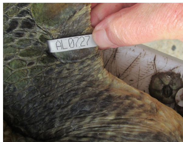
Fig. 3 Stockbrand's titanium tag (AL0727) put on the front right flipper of an individual of C. caretta

All untagged individuals of turtles captured were tagged using metallic tags (Stockbrand's titanium tag) with an Albanian address and the name of the Albanian researcher, Idriz Haxhiu (see Fig. 3). The tag was applied only on the right front limb of turtles. The first turtle tagging project in Albania began at the end of 2002, using Dalton's plastic Rototags (provided by RAC/SPA, Tunis). There were evidences that Rototags may increase the risk of turtles becoming entangled in fishing gear [14], so in this study they were replaced with Stockbrand's titanium tag (these tags lock into a closed u-shape).