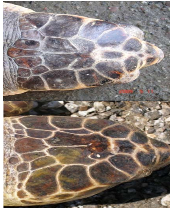
Fig. 5 Head of two different individuals of Caretta caretta (one with 4 and the other with 6 prefrontal epidermal scales)

plastron to adult males and flat plastron to adult females) or the development of nail in the front limbs of a male individual. The most obvious feature to an adult male was the tail (too long and extend outside the carapace) (see Figs. 6 and 7).