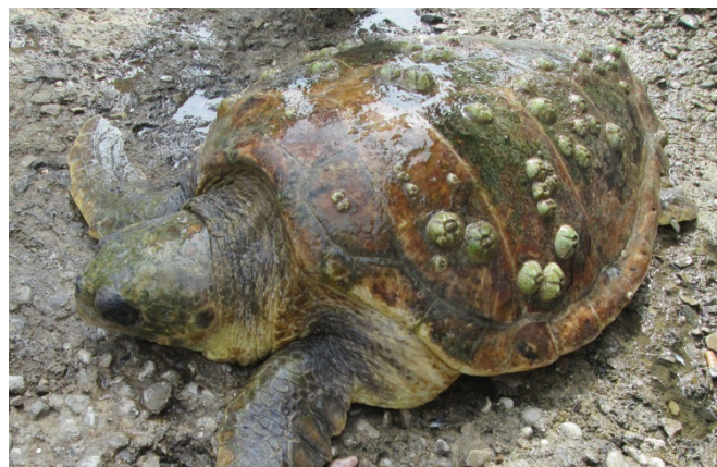
Fig. 9 An individual of loggerhead C. caretta covered with epibionts (mainly Balanus sp.)

Serpulida worms etc.) (see Fig. 9), while 42.9% were not covered with epibionts (they were clean).