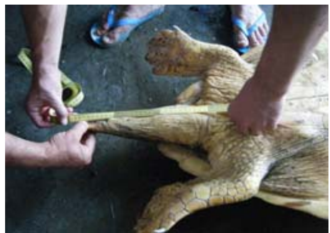
Fig. 6 The extended tail of an adult male loggerhead ( C. caretta )

Adult female individuals can be easily traced because they have a short tail and in most cases the length of the tail does not extend out of carapace.