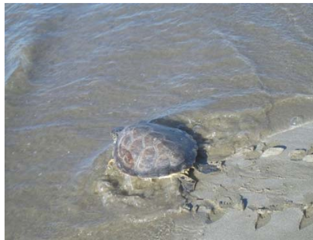
Fig. 2 A species of juvenile Chelonia mydas going back to the sea, released on 07 th of December 2013

All untagged individuals of turtles captured were tagged using metallic tags (Stockbrand's titanium tag) with an Albanian address and the name of the Albanian researcher, Idriz Haxhiu (see Fig. 3). The tag was applied only on the right front limb of turtles. The first turtle tagging project in Albania began at the end of 2002, using Dalton's plastic Rototags (provided by RAC/SPA, Tunis). There were evidences that Rototags may increase the risk of turtles becoming entangled in fishing gear [14], so in this study they were replaced with Stockbrand's titanium tag (these tags lock into a closed u-shape).