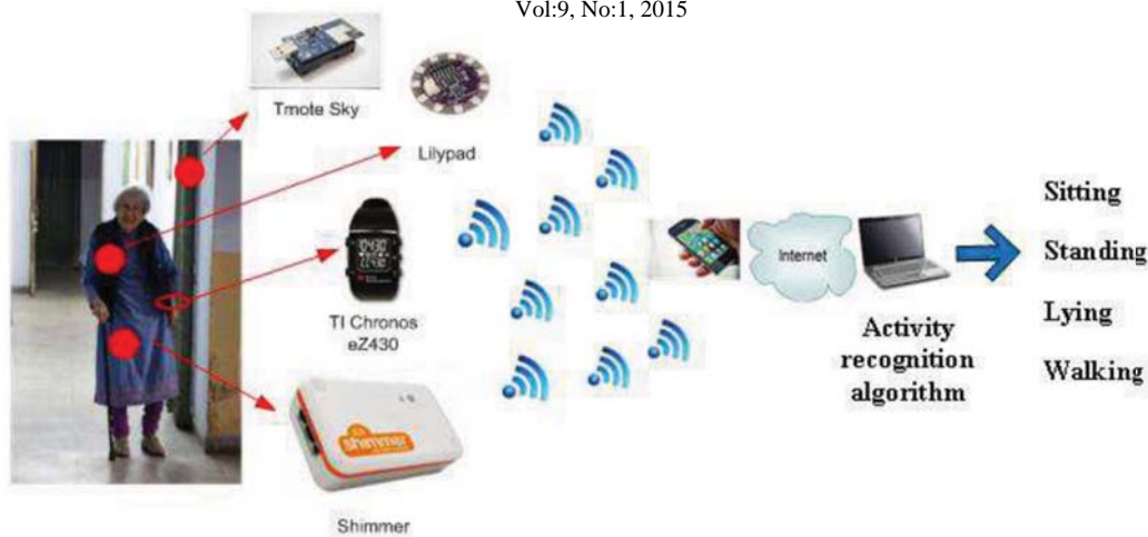
Fig. 1 An activity monitoring network with smart phone as data fusion and relaying unit

Open Science Index, Computer and Information Engineering Vol:9, No:1, 2015 publications.waset.org/10000361.pdf