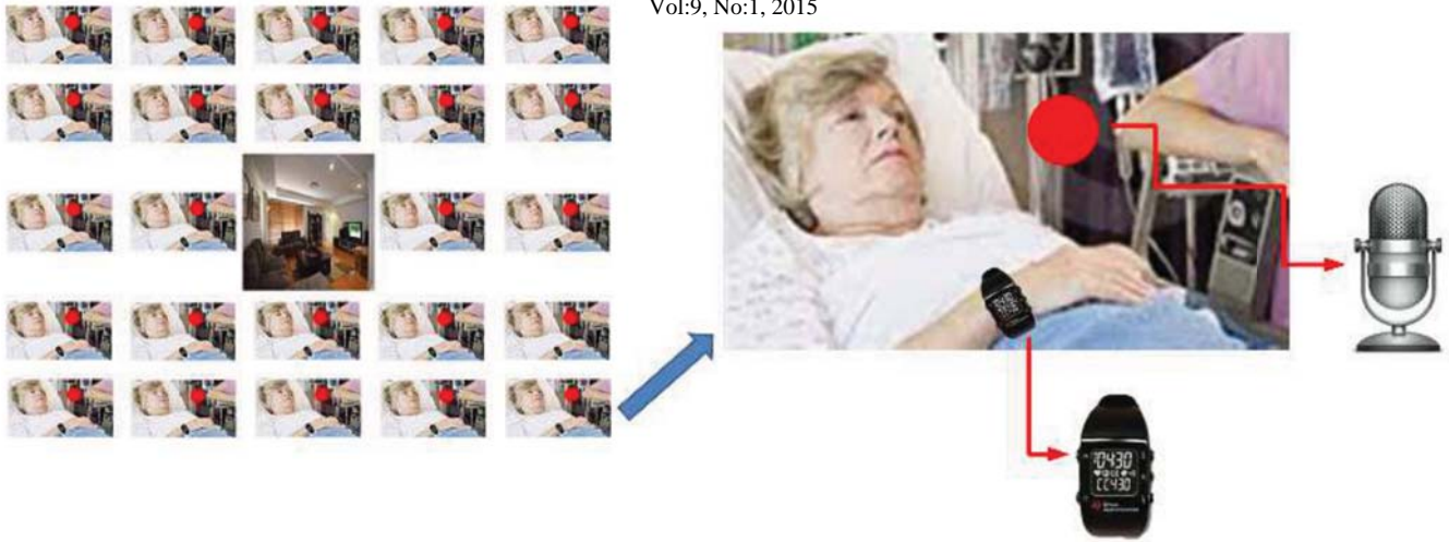
Fig. 3 Activity monitoring network topology

in a smaller amount of time, our activity set also contains walking action, duration of which highly depends on the human subject's pace in moving. As a result of calculating the size of samples coming from acceleration sensor for 2.7 seconds, we found that payload belonging to the activity data should occupy 40 bytes. In each simulation, 40, 60, 80 and 100 sensor nodes are injected in the area. 5 different topologies are simulated for each number of nodes separately and in performance evaluations, their average is calculated. For each node count, number of activity data packets transmitted is 10 times the node count. As an example, for node count 40, 10x40 activity data packets; for node count 100, 10x100 activity data packets are transmitted. The following are performance metrics used in measuring the effect of packet loss on activity recognition success: