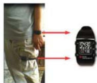
Fig. 2 Sensor placement on the body

In our activity recognition model, it is assumed that classification algorithm executed on the gateway, to which sensor data are transmitted. Activity data, composed of 3D acceleration vectors, are transmitted to the server in network packets and classification algorithm assigns the action to a class after receiving the whole vector corresponding to the action. The activity set contains sitting , standing , lying and walking actions. In data collection phase, 3D accelerometer inside TI Chronos eZ430 watch is located on the left thigh for sitting , standing and lying activities, as shown in Fig. 2, whereas it is worn on the left wrist for walking action. Training data are not lossy while test data are lossy, meaning that training data are not exposed to data loss schemes we experimented. In the testbed, configuration parameters are set as follows: Acceleration data are transmitted at 33 Hz frequency. Training and test data last for 2.5 s. Number of samples per activity is 15 and 10 for training and testing respectively.