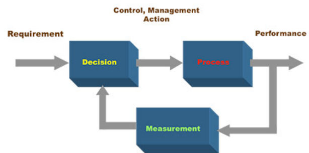
Fig. 1 Components of decision-making information system

who were seeking solutions to their problems. This has resulted in complex decision problems that ultimately have forced business organizations to seek the utilization of the effective tools of operations research. The impressive progress in the field of operations research is due in large part to the parallel development of the modern digital computer with its tremendous capabilities in computational speed and information storage and retrieval. Fig. 1 represents the components of computer information system that support decision making.