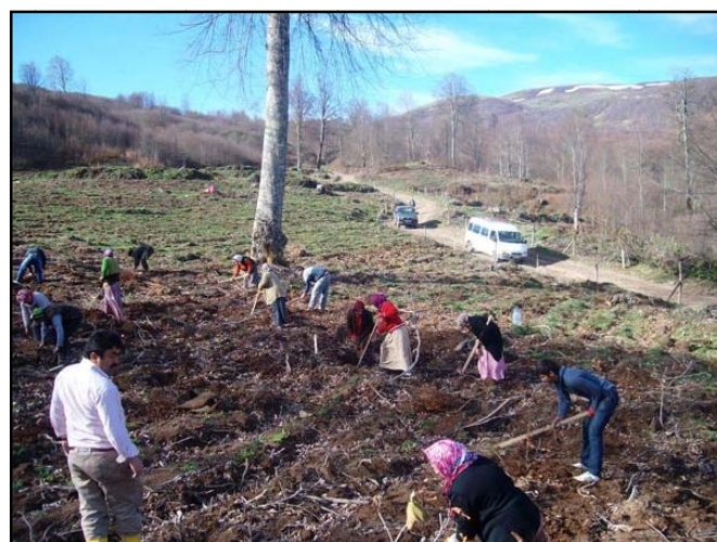
Fig. 3 Weed control through labourer power, and a view from soil processing