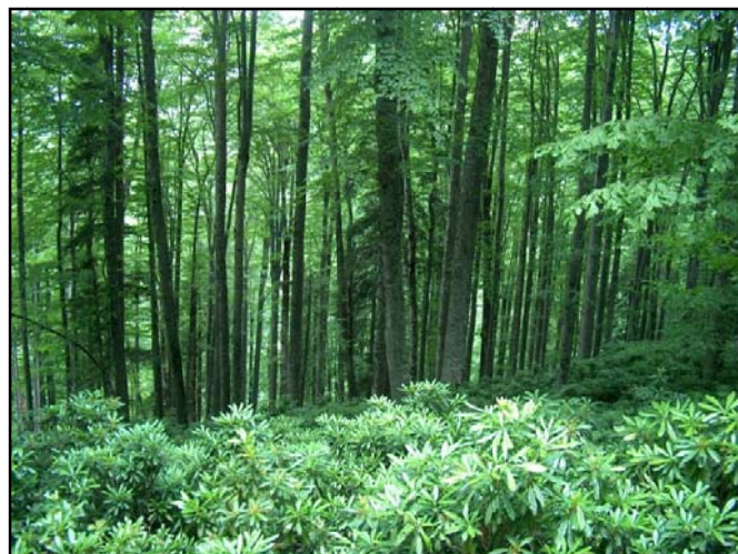
Fig. 1 Artificial regeneration area, where the weed control will be executed

The study area is 10 ha in size, 935m in altitude, it has northwestern exposure and is located in central shoulder, and it has characteristic of ruined coppice beech forest. After weed control in area, it is planned to prepare the discrete terraces in 3x2m dimensions, and to plant 2+0 naked-rooted saplings originating from Kdz. Ereğli in 3x1.5m distances between each other (Fig. 1).