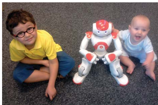
Fig. 1. Aldebaran NAO H25.