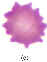
Fig. 2 The main processing operations (a) RGB image of human blood (b) Grayscale image of human blood (c) Binary image of human blood (d) Cell image segmentation (e) The cropped cell image