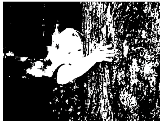
(b) Skin colour segmentation