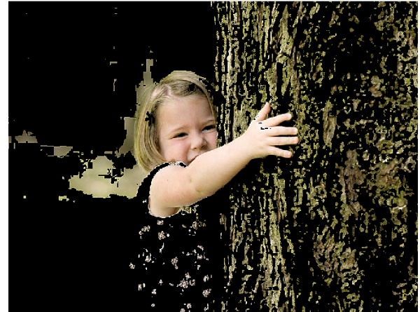
(a) Image with false skin regions

Fig. 5 shows the final image result on the sharpening skin image after texture application.