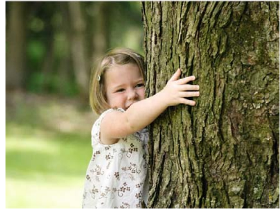
(a) Input image