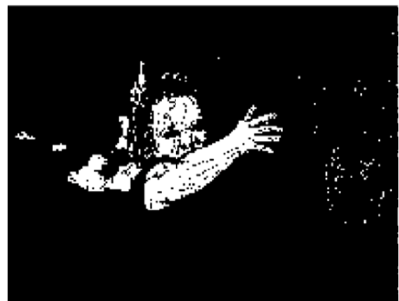
(b) False regions reduced using GLCM