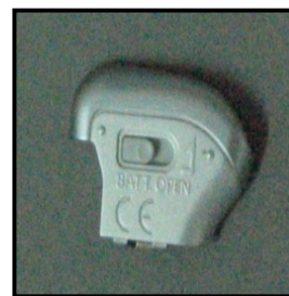
Fig. 1 Canon B. battery lid product

A new approach in designing of semiconductor equipment based Queuing Theory to reduce cycle time. They applied Queuing Theory in calculating optimum batch size for their processing equipment. They have showed the batch size required to achieve short time under different production situations [1].