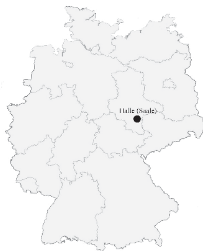
Fig. 1 Location of city Halle an der Saale in Germany

Halle an der Saale, once famous for its salt, was a center of the GDR's chemicals industry and one of the important regional cities (Fig. 1). It was considerably enlarged by the construction of Halle-Neustadt (Halle New Town), which began in the mid-sixties. By 1990, about 94,000 people lived in the new district's pre-fabricated blocks of flats, most of them are the families of workers in the area's large chemical combines. The total population of the city Halle and Halle-Neustadt increased to 309,406 inhabitants in 1990.