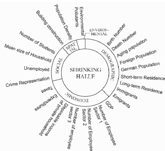
Fig. 2 The concept structure of variables of shrinking Halle

In summary, we initially established a comprehensive evaluation variable system of Halle's shrinkage (Fig. 2).