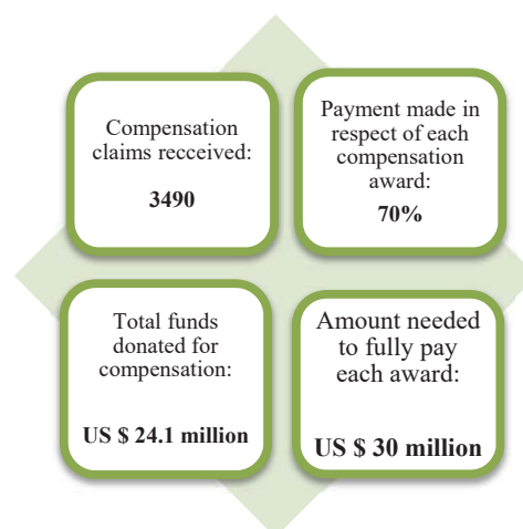
Fig. 4 Compensation

The Rana Plaza Donors Trust Fund for compensation of victims and their families has been set up with all stakeholders actively contributing to total amounts as high as US $ 24.1 million: